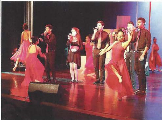
(above) Visiting Chinese students and students from the Performing Arts School in Natomas performed on stage at the Benvenuto Performing Arts Theater.

Included were special guests from JPEC including the vice principal, the dean of Arts Education, three teachers and seven students. Hundreds of students were involved from Natomas Charter in the